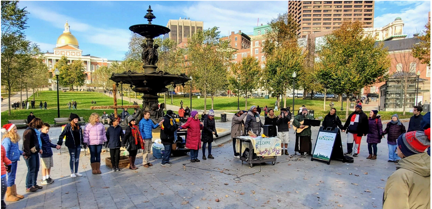
Worship at common cathedral, Boston Common

American Baptist • United Church of Christ • United Methodist